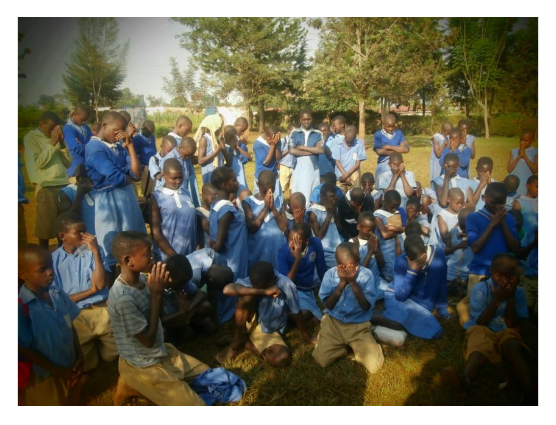
Kirra Primary School - Jinja, Uganda (East Africa)

"When a tree is chopped down, there is always the hope that it will sprout again." Job 14:7