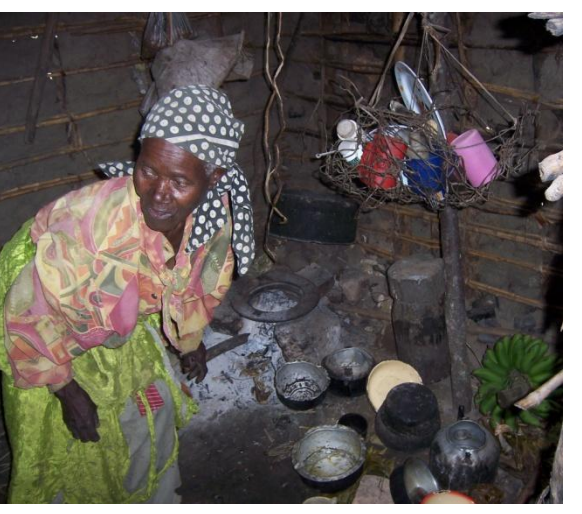
In Kakuto Rakaii district of Uganda, a 90 year of age widow looks after two of her grand children, 12 and 7 years old. On the left she shows her little kitchen are in the corner of her one roomed mud plastered, tin roof shelter.

These two boys are an example of what Building Hope Project is targeting.